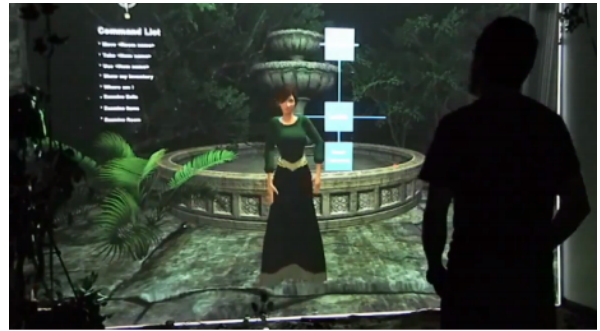
Figure 1. Interaction with the "Escape from the Castle of the Vampire King" agent.

environment but require the user's physical action, such as lighting a fire or spearing a fish.