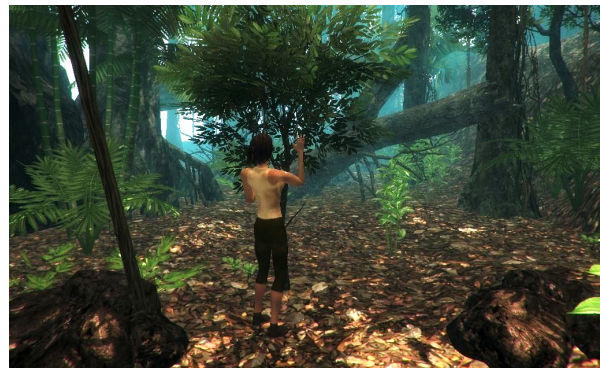
Figure 2. Jungle survival agent.