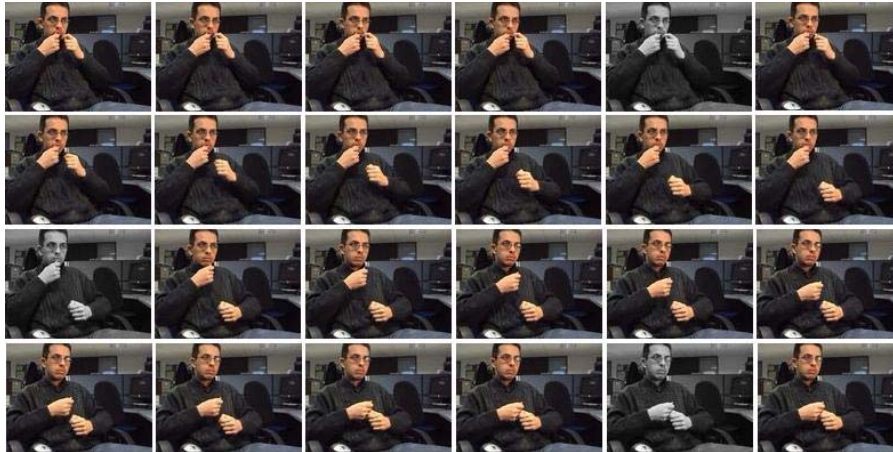
Fig. 3. A sample result employing the proposed algorithm. Here, no. 5, no. 13, and no. 23 frames (counted from left to right and from top to bottom) are detected as subunit boundaries.

background and need no gloves. The third factor is the hand motion complexity. We inspected failed cases in the experiment. One failure reason might be they are involved in somewhat complex movements, sometimes, bimanual movements. In our test data, many signs are bimanual movements. In summary, considering the point that our experiment did not avoid these three factors, we may claim that the performance of our work is impressive.