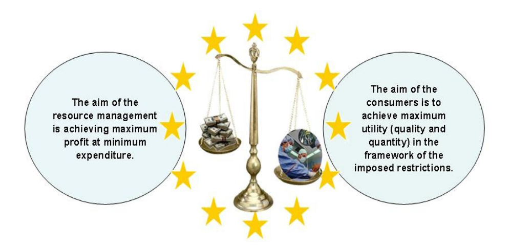
Figure 2. Balance between profit and utility in the health sector (8)

When taking decision on investing in healthcare and distribution and re-distribution of resources and spending, we should not forget that the provider of health services is mainly aiming at profit while the user (patient / customer) is orientated towards higher utility (effective care) (8). The goal of all European countries is achieving balance between profit and utility (fig. 2).